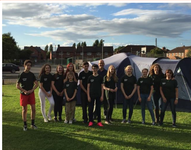
Longfield Academy, Sponsored Camp Out

Take part in the annual Venture Force sponsored cycle ride at Rutland Water or organise your own sponsored event!